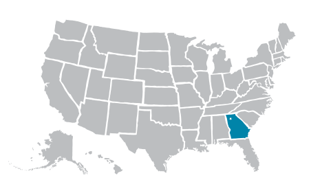
#1 in the nation for reliability (Institute of Electrical and Electronics Engineers' 2024 benchmark year study results)